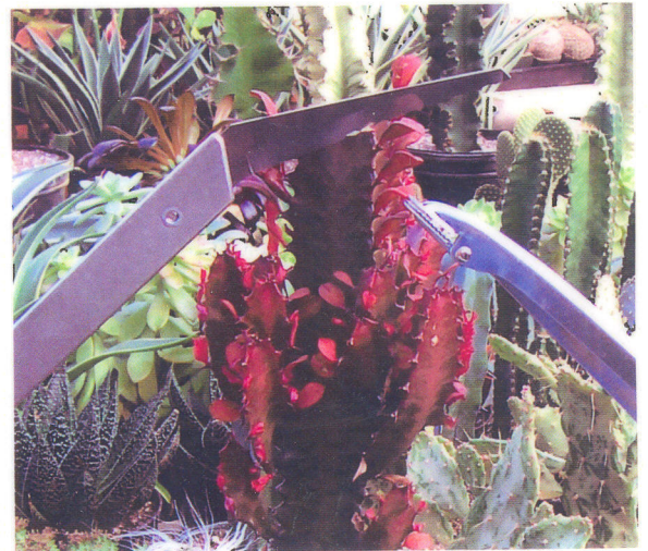
Cactus Saw and Gripper